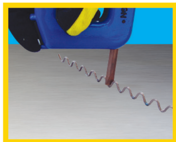
Wiggle Wire for Bear Claws