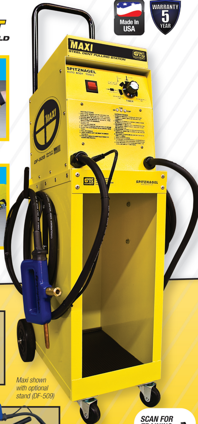
Maxi shown with optional stand (DF-509)