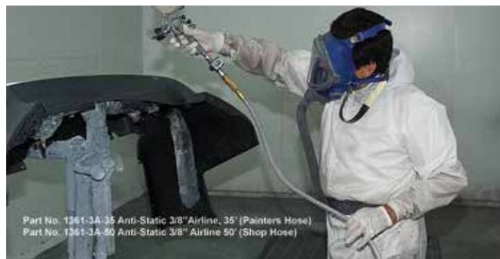
Part No. 1361-3A-35 Anti-Static 3/8" Airline, 35' (Painters Hose) Part No. 1361-3A-50 Anti-Static 3/8" Airline 50' (Shop Hose)

Clear, crushproof, reinforced construction allows instant detection of airborne contamination. The anti-static design decreases electrical charge to improve metallic orientation for both solvent & water based paints. Reduces static charge and dust build-up on plastic parts and bumpers. The lightweight, durable design with a large inside diameter improves airflow for better spray gun and air tool operation.